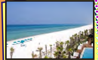
Casa Loma's Beautiful View

Easy Student Payment Plan $49 per person 1st payment due by December 22, 2011 $42 per pers on due by the 5th of the following months Jan, Feb, March, April, 2012 Final balance due May 1, 2012 - See TPA for Booking Details Package Price is $258 w/ $9 per person non-refundable damage/security/booking fee Final Payment if within 22 days of trip departure must be by cashiers check or money order.