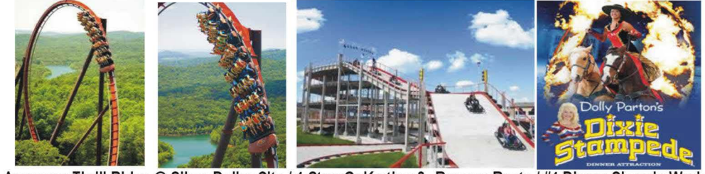
Awesome Thrill Rides @ Silver Dollar City / 4-Story GoKarting & -Bumper Boats / #1 Dinner Show in World