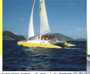
SPIRIT OF AMERICA

Your package includes choosing between the Ducks Land/Water Adventure or a Spirit of America Catamaran Beautiful Lake Sail WANT TO DO BOTH?? Add $29