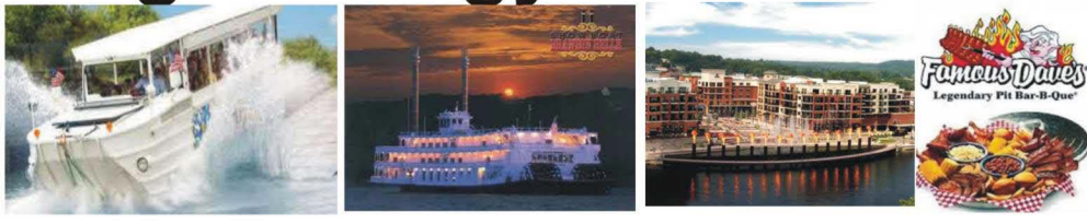
The Duck Tour Land&Water MoonLight Dinner Cruise Shopping at the HUGE "Landing"!!