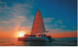
Dinner & Sunset Cruise