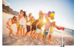
BEACH TIME !!