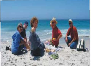
Shell Island Picnic