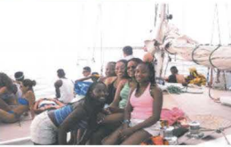
Class Trip Memories