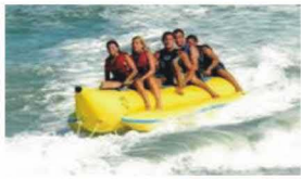
Banana Boat Ride