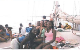
Class Trip Memories