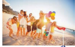
BEACH TIME !!