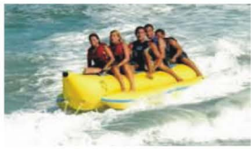
Banana Boat Ride