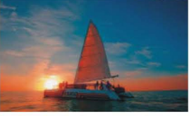
Dinner & Sunset Cruise