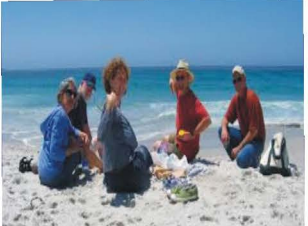
Shell Island Picnic