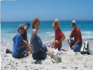
Shell Island Picnic