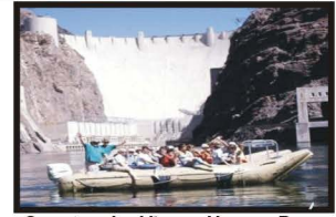
Spectacular Views -Hoover Dam from Your Boat in the Colorado River