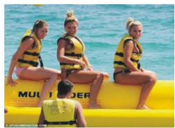
Fun Activities Offered