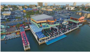
"Louie's Backyard Dining"