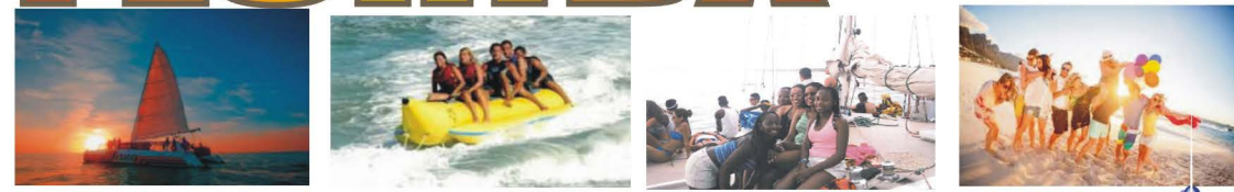
Dinner & Sunset Cruise Banana Boat Ride Class Trip Memories BEACH TIME !!