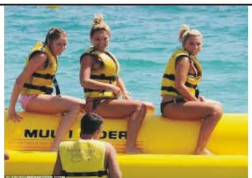
Fun Activities Offered