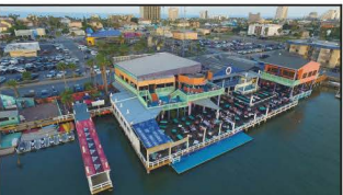
"Louie's Backyard Dining"