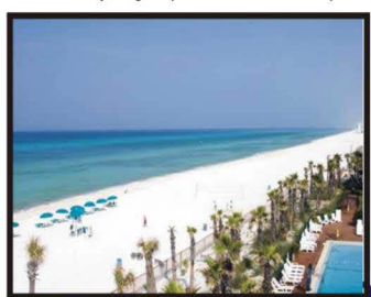
Enjoy This Beautiful View of PCB's Famous White Sand Beach From All Student Rooms

ATTN: See TPA (Tour Participant Agreement) with Class Sponsor/Teacher or at BeachBreaks.com for Booking & Cancellation Details All NEW Hygiene Protocols Are Followed or Exceeded by Our Vendors Nationwide ! Everything is space available until deposited - No Holidays/Peak Periods Available